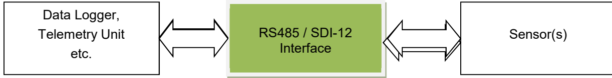
Figure 3 –TBS07 basic application setup

The setup requires a data logger or telemetry unit with RS485 interface capable of handling ASCII strings representing SDI-12 commands. The TBS07 receives commands from the RS485 Interface (e.g. via data logger, RTU or PC), and transfers the commands to the SDI Interface, waits for sensor response and transfers the response (measurement results, etc.) back to the RS485 Interface of the data logger, RTU or PC. All SDI-12 commands are supported. It transparently forwards SDI-12 commands and sensor response in ASCII between a master with RS485 interface and sensor(s) with SDI-12 interface. It takes care of all SDI-12 standard related protocol and electrical requirements.